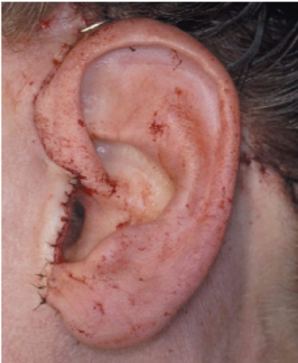
Figure 222.4 The post-tragal closure requires that the skin flap over the tragus is tension free. Removal of subcutaneous fat on the tragal flap will ensure good tragal definition.

A wide variety of liposuction cannulas exists, ranging from flat to round-tipped with an array of suction port designs. Surface irregularities appear to be minimized with the use of smaller cannulas. We prefer pre-tunnelling with a 2 mm cannula followed by applied low suction. The cannula is inserted into the subcutaneous space between the dermis and platysma. The dominant hand controls movement of the cannula while the contralateral hand guides tip position. Pre-tunnelling involves limited dissection to facilitate passage of the larger cannula. Liposuction is performed by dissecting with the cannula in radial fashion away from the incision. One atmosphere (760 mmHg) of negative pressure is usually sufficient. The suction port should always be directed away from the skin to minimize dermal trauma and dimpling. Uniform suctioning is performed across the submental triangle down to the hyoid bone. Liposuction should be limited near the inferior border of the mandible to avoid injuring the marginal mandibular nerve. Periodic inspection of skin using the 'pinch and roll' technique helps determine the degree and extent of liposuction required. A sufficient amount of fat should remain to maintain natural skin cushioning.