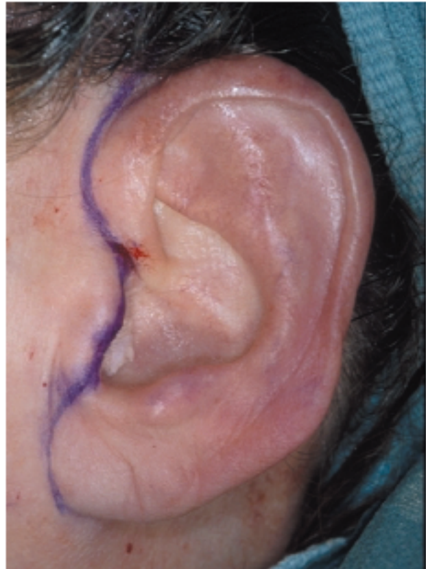
Figure 222.1 The post-tragal incision is placed just behind the tragal cartilage. Note how the outline of the tragus is defined by the incision.

The lobule incision can be variably positioned. In patients with a 'hanging' lobule, the incision can be placed 1–2 mm below the lobule attachment and readily camouflaged. If a dependent lobule is not present, the incision is made at the junction of the lobule and infra-auricular skin. The lobule incision extends onto the posterior surface of the auricle coursing over the conchal bowl. Approximately 3–5 mm should remain between the incision and the post-auricular sulcus. In the male patient, the incision rests within the sulcus to avoid displacing hair-bearing skin onto the ear. The incision extends to the level of the fossa triangularis before turning posteriorly. A less dependent skin flap can be created in patients with a smoking history by limiting the superior extent of this incision. A V-shaped dart is created as the incision