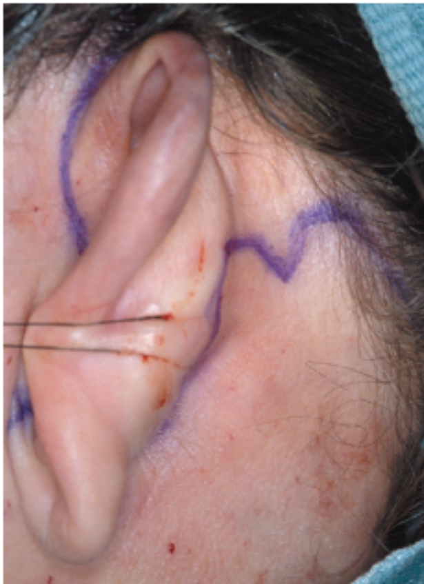
Figure 222.2 The post-auricular incision runs along the posterior surface of the conchal cartilage with a V-shaped dart in the posterior limb of the incision as it moves toward the hairline. This dart acts to break up the scar and prevent scar contracture.

Once the skin flap is elevated, the SMAS is identified. A horizontal incision is made in the SMAS just below and parallel to the zygomatic arch but limited to the posterior